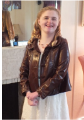
I get to participate in musical theater & deepen my friendships

Every year I do a run/walk for the Delta Gamma Center for Children with visual impairments. I even get to walk with all my Delta Gamma friends.